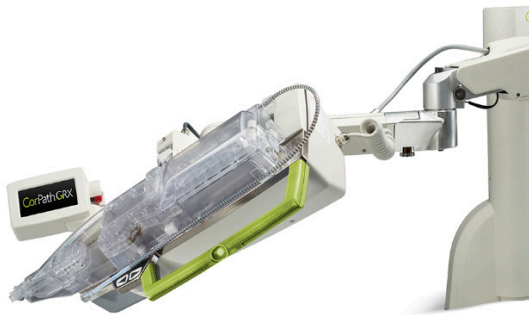
Corindus bedside unit with extended-reach arm and touchscreen.

“Model-Based Design is essential to our ability to innovate because it lets us develop new capabilities and deploy them quickly. We can rapidly build a prototype, show that it meets requirements, and then perfect it as we move into the product development phase.”