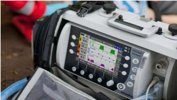
The MEDUMAT Transport ventilator.

The MEDUMAT Transport ventilator moves a mixture of oxygen and air into and out of the lungs of patients who require breathing support. It is designed for use in emergency care and during transport for intrahospital or interhospital transfers.