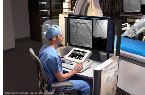
Corindus CorPath GRX Surgical Robotic System.

If your team is using handwritten code and document-based requirements, the only way to answer these questions is through trial and error or testing on a physical prototype. This is the case whether the application is a surgical instrument, a ventilator, an infusion pump, or a dialysis machine. If a single requirement changes, the entire system might need to be recoded and tested, delaying the project by weeks or even months.