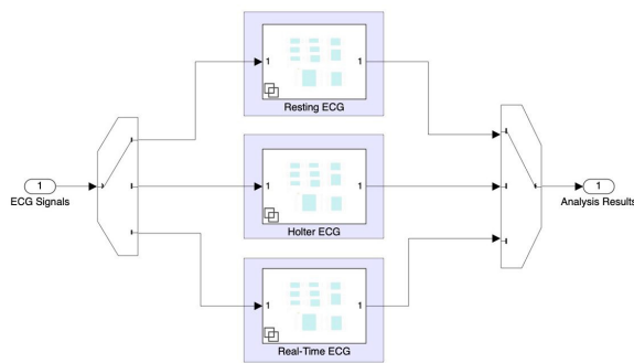
ECG signal analysis algorithms modeled in Simulink.

“We’ve seen a significant return on the investment we made in Model-Based Design, including higher quality, reduced development times, and faster ISO and IEC certification.”