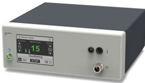
A 50L insufflator from WOM.

Laparoscopy and other minimally invasive procedures must be performed within tightly confined spaces in the abdomen. To increase freedom of movement for surgical instruments, insufflators are used to expand the body cavity by blowing CO 2 gas into it. WOM, a market leader in insufflator and pump technologies for laparoscopy and hysteroscopy, uses Model-Based Design to accelerate the development of high-quality insufflator control software.